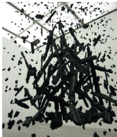
CHRISTINA SHARPE In the Wake On Blackness and Being

For a moment restricting ourselves to the human, but the ecology of life, migration and survival clearly precedes, exceeds and sustains the category, another history emerges from the depths of modernity. Human migration is transferred from a peripheral question, confined to the social and economic margins, and joins the mobility of goods and capital in the making of modernity. Migration now becomes the history of modernity. The global exploitation of human labour and the world-wide raiding of material resources that fuel progress not only persists, but now unavoidably insists. What was distanced, even hidden, far away in the colonial spaces of the plantations and the mines, the slave trade and subsequently in the politically refused slums of the metropolitan world, explicitly returns to triangulate our modernity with the constitutive coordinates of capitalism, colonialism and the moral justification of racism.